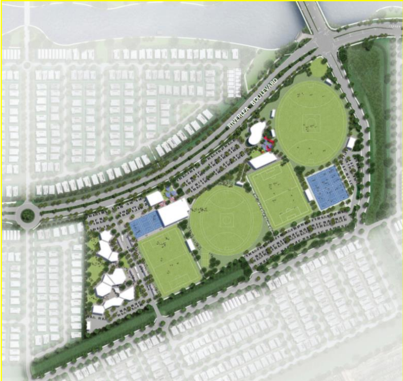
Image above is an indicative concept only.

Address: Adjacent Riverlea Boulevard, Riverlea, 5120