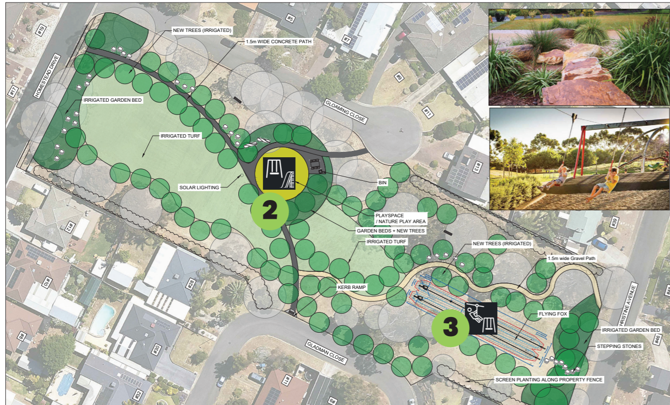
Proposed concept plans show examples of option 1 large flying fox, option 2 basket swing and small slide, option 3 standard flying fox and basket swing. Please note option 4 is no play equipment with additional greening across the reserve.