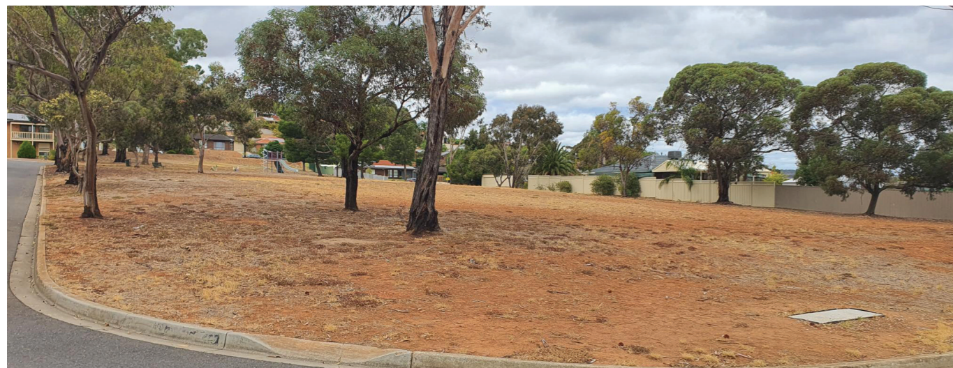
Current images of Gloaming Reserve.