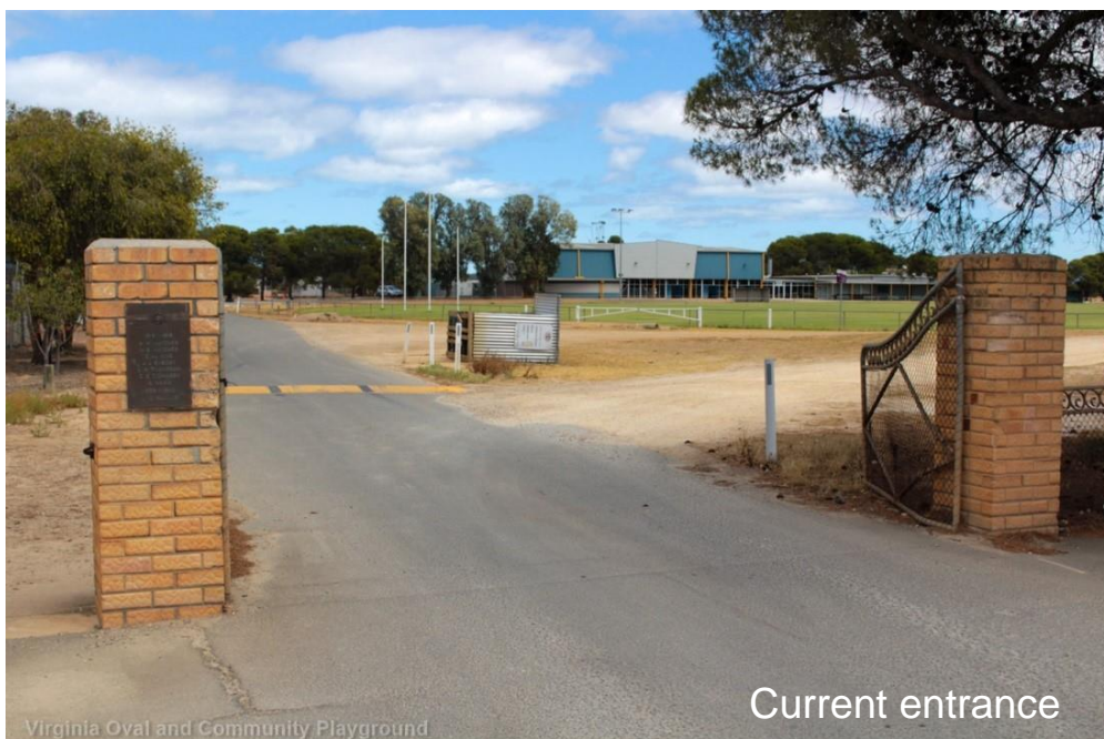
Virginia Oval and Community Playground

The proposed design incorporates a restored memorial plaque, protects the pine trees, and includes a lowline fence for signage display for the club.