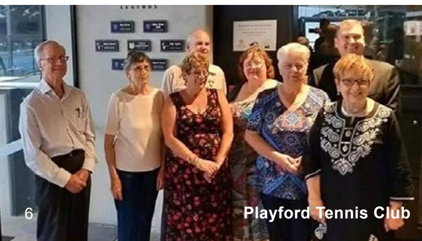
Playford Tennis Club