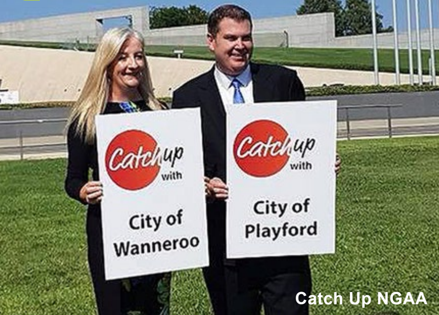
Catch Up NGAA