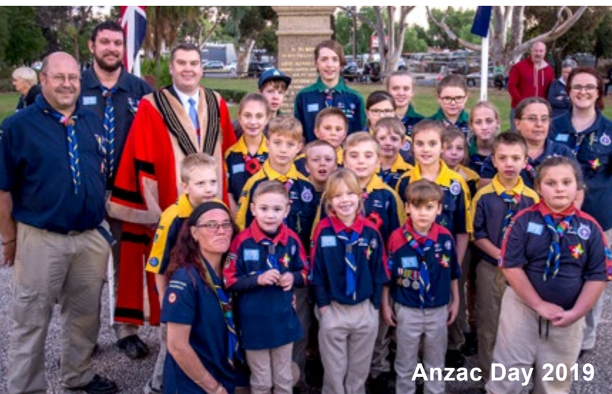
Anzac Day 2019

We welcome your contribution to developing our future.