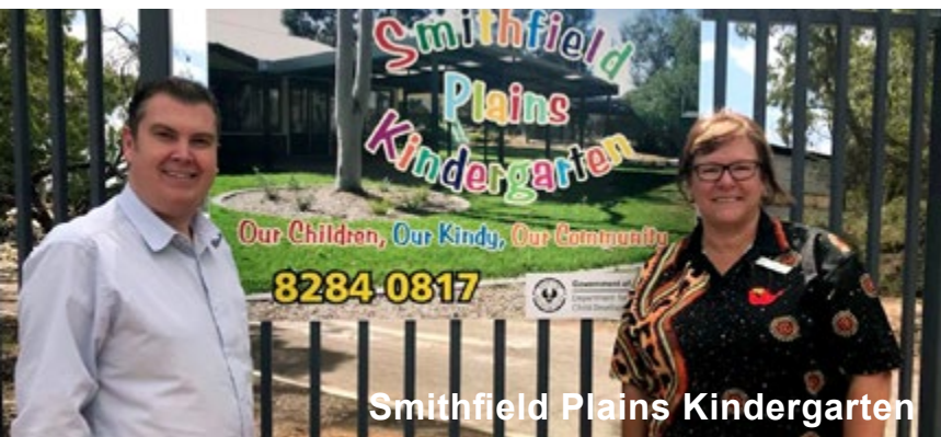
Smithfield Plains Kindergarten